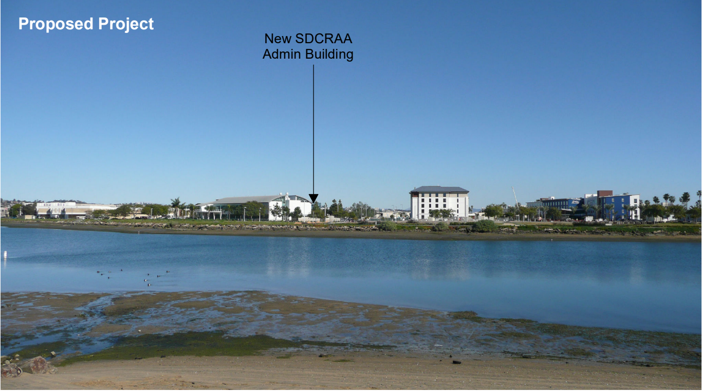
Location Liberty Station NTC Park – South Existing View Description