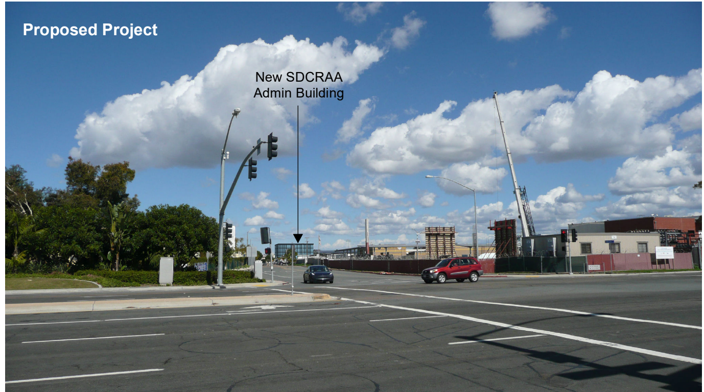
Location North Harbor Drive and McCain Road