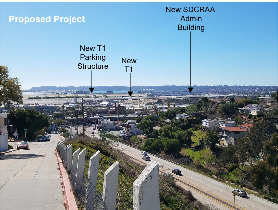
Location Andrews Street and Puterbaugh Street