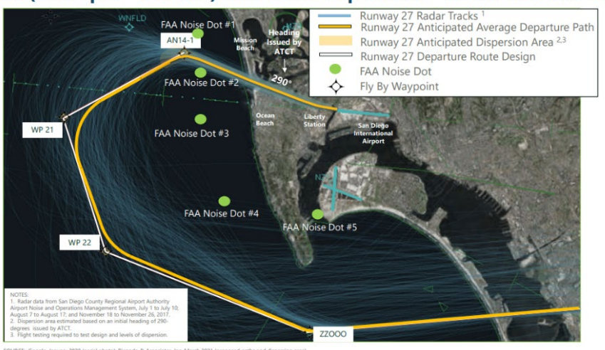
Nighttime (10:00 pm - 6:30 am) Eastbound Departures - Vector to RNAV Design

4. To reduce noise in Point Loma, Ocean Beach and La Jolla (from aircraft taken off course) during nighttime hours, create a new RNAV departure with an Airport Traffic Control Tower issued heading as an initial leg to maintain current dispersion from 290-degree nighttime heading and then add a new waypoint where aircraft join a similar route as ZZOOO SID. This request was determined feasible for nighttime hours only and approved by ANAC on May 5, 2021 and submitted to the FAA on May 26, 2021. Copies of the submittal can be found in the member materials here.