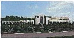
Vista Civic Center

As a member of the League of California City's Transportation, Communication and Public Works Policy Committee since 1995, he actively assists California cities in formulating their policies on public works matters. He has lectured at the annual Public Works Officers Institute since 1999 on developments in the California laws affecting public works. He was also the original co-author of the public works chapter of the California Municipal Law Handbook published by the City Attorneys Department of the League of California Cities.