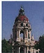
Pasadena City Hall