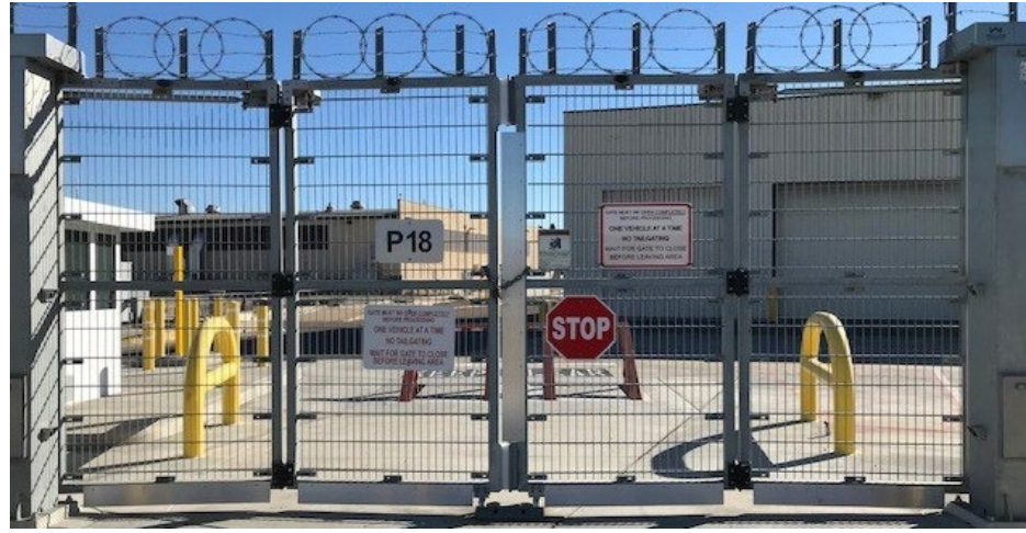
Proposed P-01 Gate – Bi-fold SpeedGate