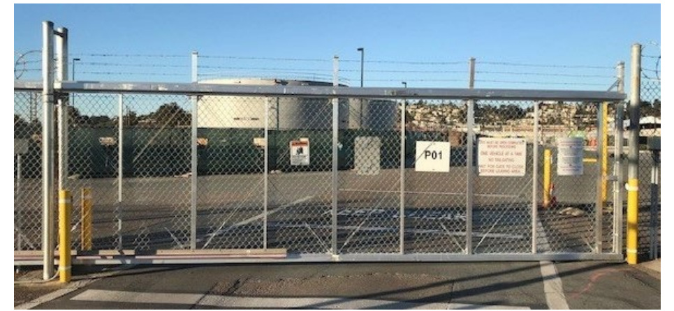
Existing P-01 Gate – sliding gate