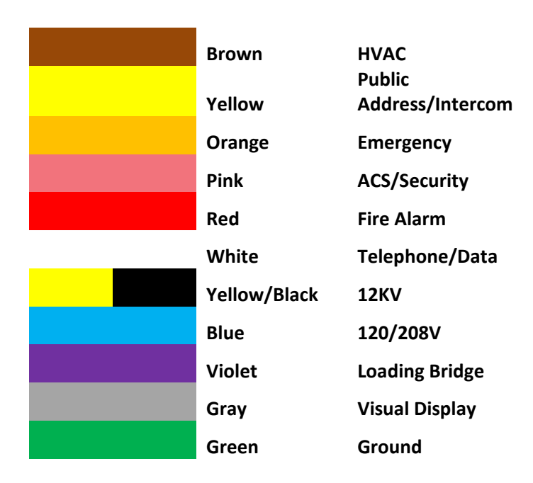
TABLE - 3: COLOR CODE** FOR ALL ELECTRICAL CONDUITS AT SDCRAA