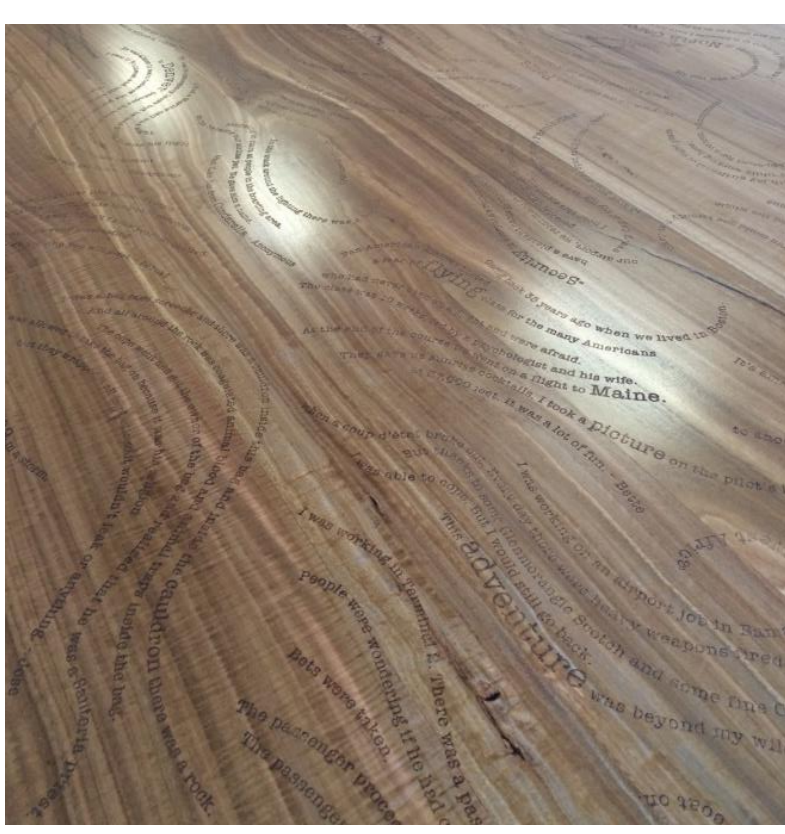
Travel Desk Sheryl Oring Pre-security Terminal 2 East