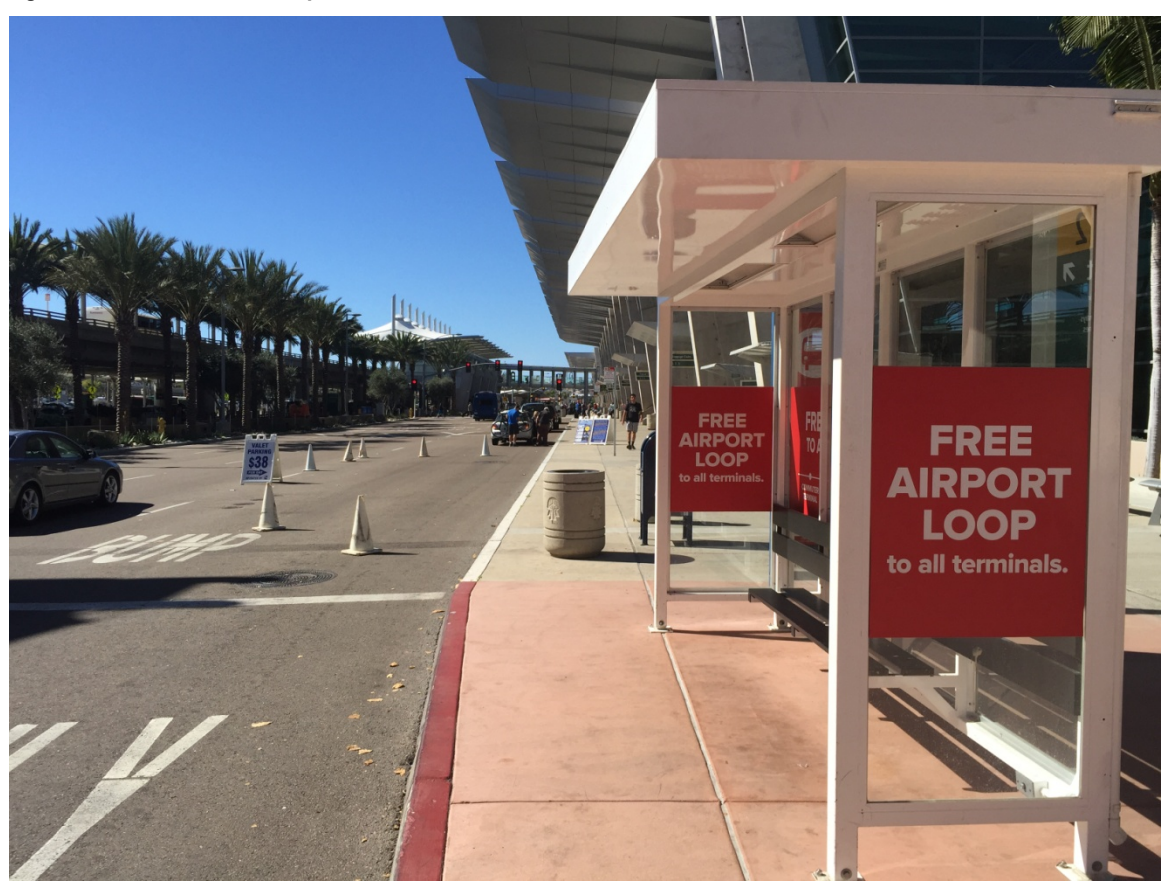
Figure 4 Route 992 Stop at Terminal 2

This shelter is shared by the airport's internal circulator shuttle service and Route 992. However, while signs for the airport circulator are prominent, only a small MTS logo to the side of the shelter indicates that the stop is also used by local buses. Additionally, the stop's location is at the far end of the curb outside the terminal, further reducing the visibility of MTS service.